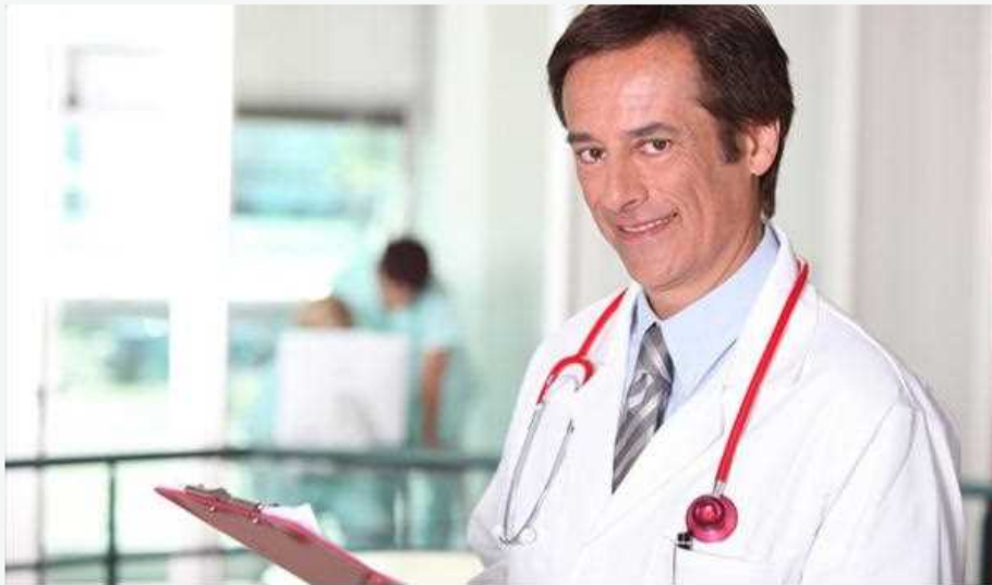
Bronchitis Side Effects

Bronchitis is an intense inflammation of the air passages within the lungs. In addition, people who have asthma also experience an inflammation of the lining of the bronchial tubes called asthmatic bronchitis. Bronchitis Acute Bronchitis is the material of this makeup. This affliction causes inflammation and damages the very small air sacs (alveoli) in the lung tissue and will usually cause some form of. All About Acute Bronchitis( Part Two) In the first part of our article you might have found out about acute bronchitis: what it's, which are the symptoms that can let you know if you have acute bronchitis. Bronchitis is a respiratory condition where there is inflammation in the lining of the bronchial tubes which lead to the lungs.